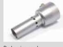
De-horning nozzle Article No: 107.007