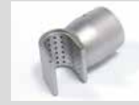
Sieve reflector 35 x 20 mm Article No: 107.309