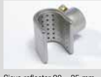
Sieve reflector 20 x 35 mm Article No: 107.310