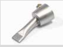
Wide slot nozzle 20 mm Article No: 106.998