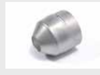
Round nozzle 20 mm Article No: 107.229