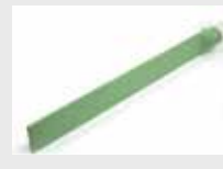
Sword-shaped nozzle (edges rounded) 74 x 12 x 520 mm, PTFE coated Article No: 107.347