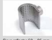
Sieve reflector 50 x 35 mm Article No: 107.311