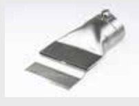
Scraper nozzle Article No: 142.281