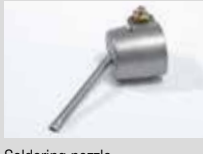
Soldering nozzle Ø 3 x 1.5 mm, oval Article No: 107.148