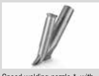
Speed welding nozzle *, with small air-slide, Ø: 3 mm / 4 mm / 5 mm Article No: 105.431 / 105.432 / 105.433