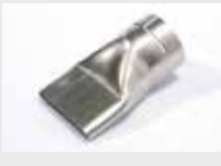
Wide slot nozzle 70 x 10 mm Article No: 107.258