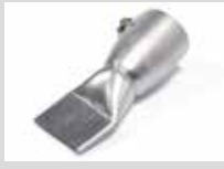
Wide slot nozzle 40 mm Article No: 106.999