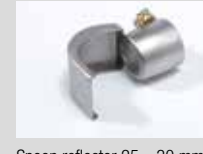
Spoon reflector 25 x 30 mm Article No: 107.312