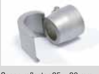
Spoon reflector 25 x 30 mm Article No: 107.313