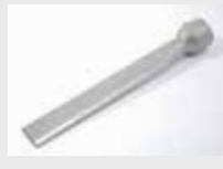
Sword-shaped nozzle 45 x 12 x 350 mm Article No: 105.961