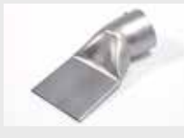
Wide slot nozzle 75 x 2 mm, Ø 50 mm Article No: 107.653