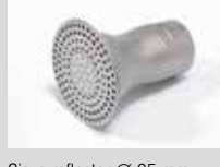
Sieve reflector Ø 65 mm Article No: 107.319