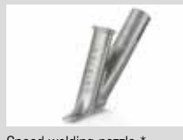
Speed welding nozzle *, triangular shaped, 5.7 mm / 7 mm Article No: 106.992 / 106.993