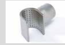
Sieve reflector 50 x 35 mm Article No: 107.308