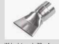
Wide slot nozzle 70 x 4 mm Article No: 107.261