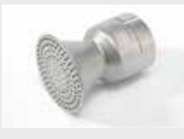
Sieve reflector Ø 65 mm Article No: 106.127