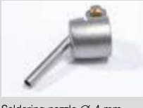
Soldering nozzle Ø 4 mm Article No: 107.151