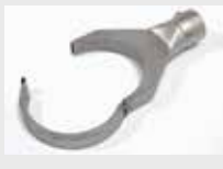
Folding reflector 125 x 22 mm Article No: 107.330