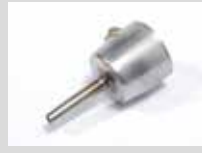
Tubular nozzle Ø 5 mm Article No: 107.154