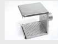
Sieve reflector 150 x 130 mm Article No: 107.333