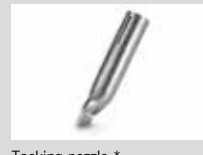
Tacking nozzle * Article No: 106.996