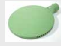
Welding mirror 270 mm, PTFE coated Article No: 107.346