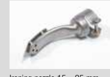
Ironing nozzle 15 x 25 mm Article No: 107.305