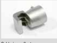
Soldering reflector 17 x 34 mm Article No: 107.325