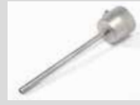
Extension nozzle Ø 5 x 130 mm, straight Article No: 107.006