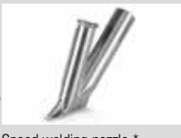
Speed welding nozzle * Ø: 3 mm / 4 mm / 5 mm Article No: 106.989 / 106.990 / 106.991