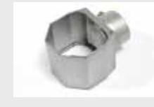
Folding reflector 60 x 75 mm Article No: 107.328