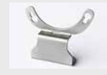
Tool stand only for ELECTRON ST Article No: 151.068